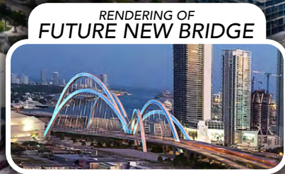
RENDERING OF FUTURE NEW BRIDGE