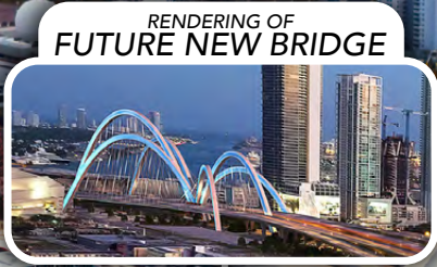
RENDERING OF FUTURE NEW BRIDGE