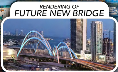
RENDERING OF FUTURE NEW BRIDGE